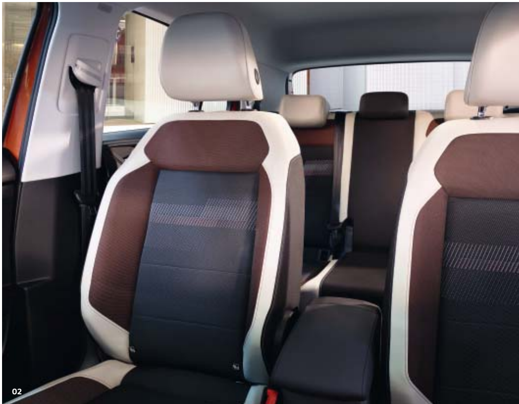
02 The seat upholstery for the central and inner panels is finished in Orange and Ceramique for a modern, cool aesthetic. The colours certainly enhance the look of the sports comfort seats. OE