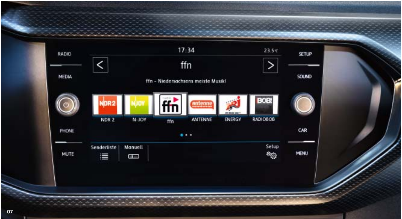
07 The Composition Media radio includes a 20.3 cm (8-inch) TFT colour display, a touchscreen with proximity sensor and an MP3- and WMA-compatible CD player. The six loudspeakers complete the picture to create a multimedia experience. Furthermore, it also features an SD card slot, a USB port and a Bluetooth connection for mobile phones. OE