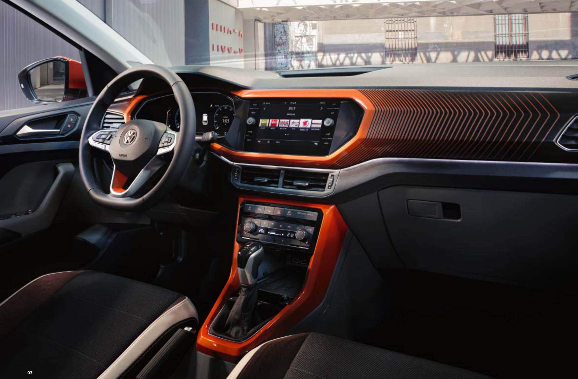
03 A real eye-catcher: The Transition décor with 3D design in Energetic Orange and Grey is an arresting design highlight. OE