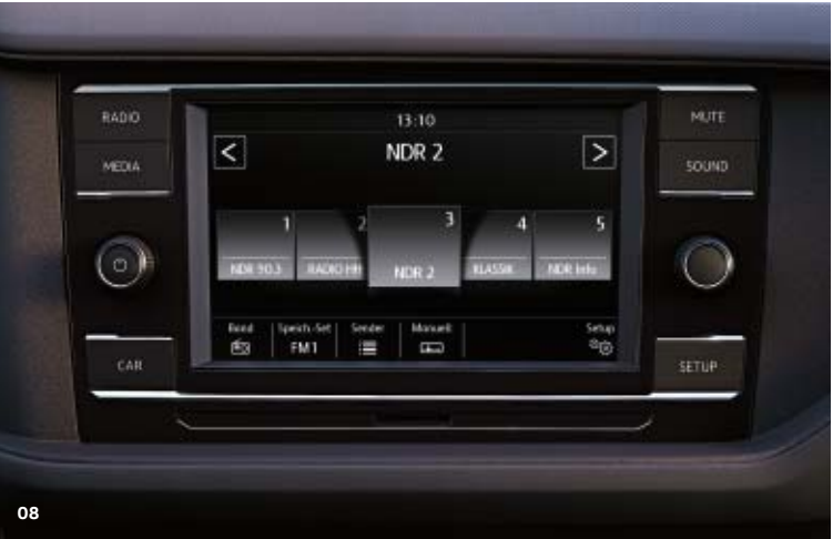
08 The Composition Colour radio features a 16.5 cm (6.5-inch) TFT colour display including a touchscreen and two loudspeakers, and it also includes an SD card slot. S