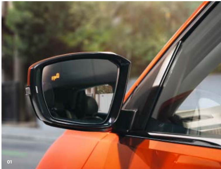
01 The Blind Spot sensor activates LEDs in the relevant exterior mirror to warn you if there is a vehicle in your blind spot. 1) When reversing out of a parking space, the integrated Rear Traffic Alert system can monitor the area behind your vehicle and warn you of any traffic that crosses this space. 1) S