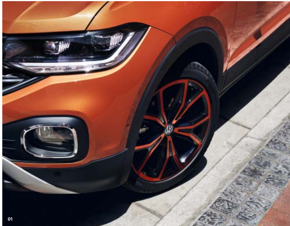
01 The 18-inch Köln alloy wheels in Hot Orange, for the new T-Cross Style, provide a splash of colour that simply cannot be ignored. OE