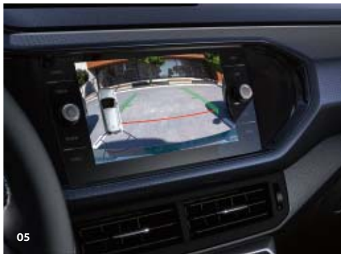
05 The Rear View reversing camera helps in reversing manoeuvres. 1) The camera image on the radio display or navigation system shows the area behind the vehicle. OE