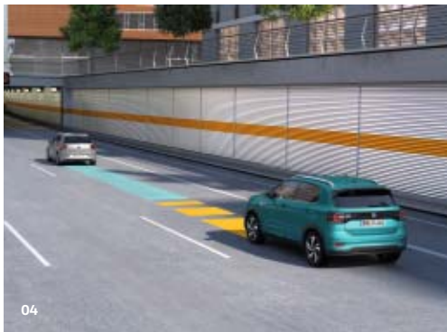
04 The ACC adaptive cruise control can help you to maintain a set top speed 3) and fixed distance from the vehicle in front. 1) OE