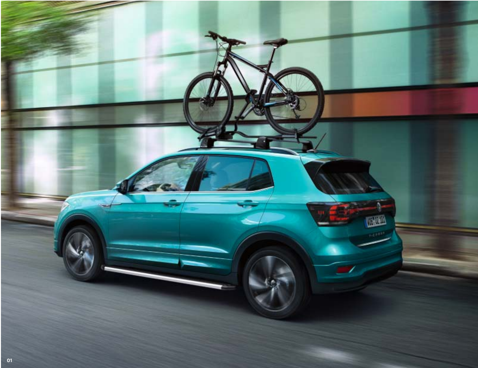
01 Original accessories for a striking offroad appearance: the silver anodised aluminium running boards with anti-slip coating give the vehicle a distinctive, robust look. OE