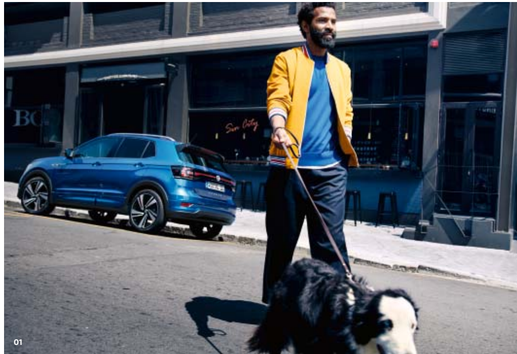
01 Whether it's with the 17-inch Sebring alloy wheels fitted as standard, or 18-inch Nevada alloy wheels , you can make your new T-Cross really shine with an extensive choice of wheels. OE

With the strikingly sporty features of the R-Line Exterior equipment, all eyes will be on you: from the dynamic front with black-grained radiator grille, bumpers in high-gloss black, and the black-grained wheel arch, to the athletic rear with R-Line-specific diffuser and bottom of the bumpers in the same colour as the car. The door trim in R-Styling and design strips with an R-Line logo on the side panels and front doors will attract even more attention. OE