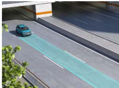
02 The Lane Assist lane departure warning system can – from speeds of 60 km/h – detect whether the vehicle is unintentionally leaving its lane. 1) The corrective steering assistance feature can prompt the driver to return their attention to the road. 1), 2) S

Volkswagen is bringing together all its driver assist systems under the IQ.DRIVE label. A wide range of these innovative technologies are also used in the new T-Cross, to bring you even greater comfort and safety – and to make mobility even more relaxed.