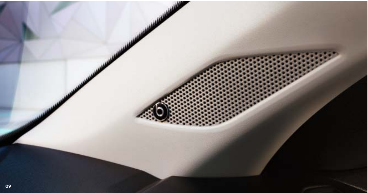
09 Do you need your music to be big on bass? The beats sound system from the audio specialists at BeatsAudio is designed to provide optimum sound in your new T-Cross, wherever you're sitting. The subwoofer 1) produces solid, earth-shaking bass tones. All speakers are supported by an eight-channel amplifier with 300 watts output – plenty of power to get you and your passengers rocking. OE