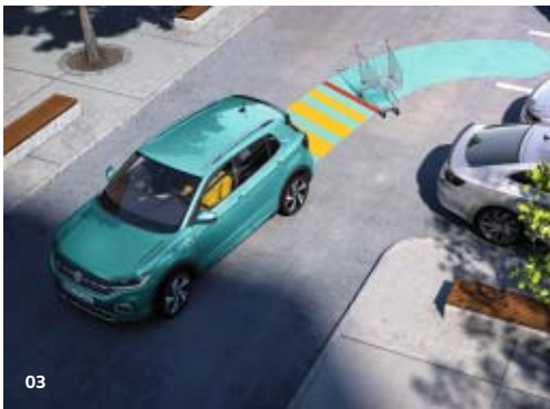
03 When manoeuvring, the Park Distance Control system issues acoustic and visual warnings when it detects obstacles in front of or behind the vehicle. 1) The integrated manoeuvre braking function can prevent collisions, or minimise their impact, by applying an emergency brake when reversing at speeds up to 10 km/h. 1) You can activate the manoeuvre braking function at the touch of a button, enabling it to intervene when the vehicle is driving forward as well. LF ST