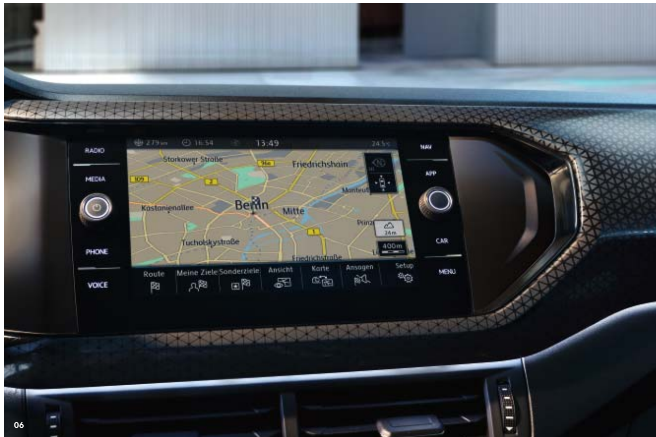
06 The Discover Media navigation system for the Composition Media radio features a 20.3 cm (8-inch) TFT colour display, pre-installed map data for Europe, a touchscreen with proximity sensors and an MP3-, AAC- and WMA-compatible CD player and six loudspeakers. The system also includes two SD card slots, a USB port and a Bluetooth connection for mobile telephones. And with mobile online services from Car-Net, you can enjoy a fantastic connection, even when you're on the road. OE