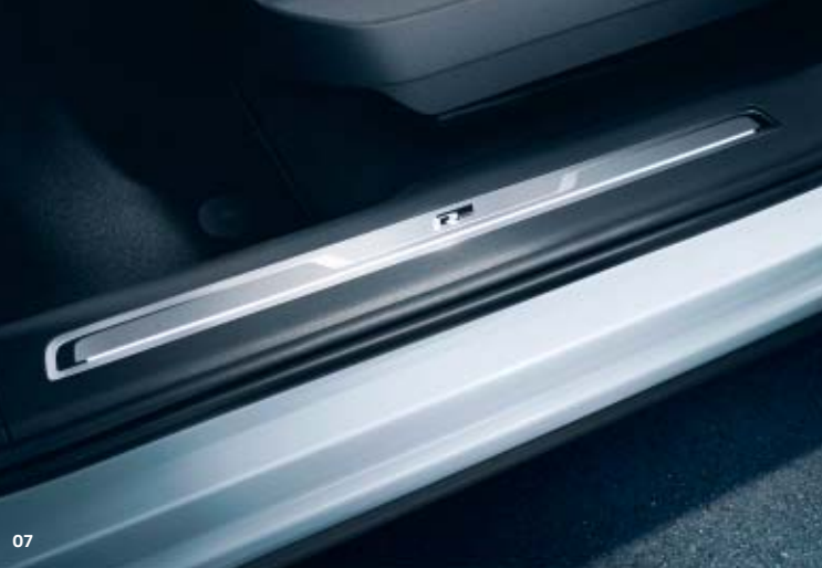
07 Start and finish line in one: the front aluminium sill panel trim with the R-Line logo. SO