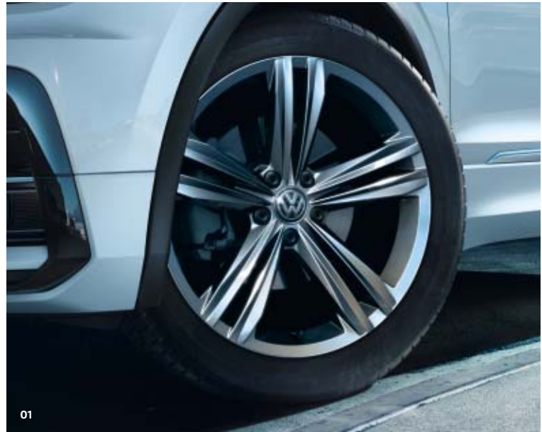
01 With their 5 double-spoke design in Grey Metallic, the 19-inch “Sebring” alloy wheels cut an impressive figure on the road. 50

These equipment packages are offered by Volkswagen R GmbH. Please refer to www.volkswagen.com for additional information.