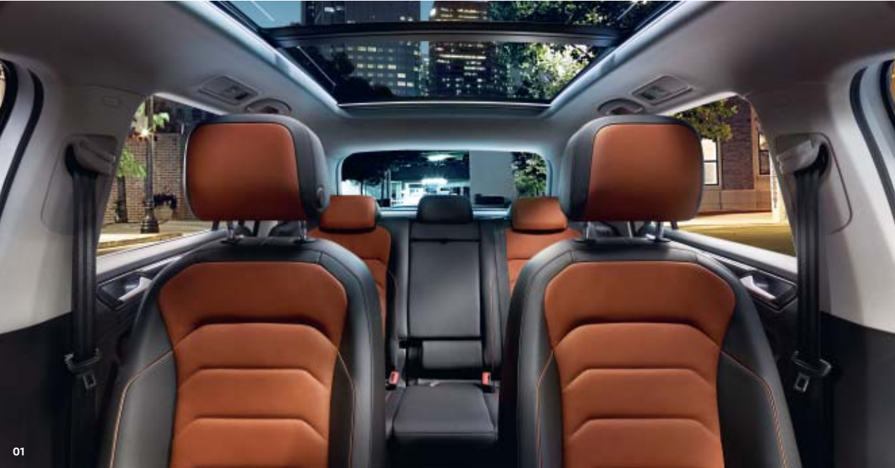
01 Thanks to the variable seating system , all seat backrests next to and behind the driver's seat can be folded down. Furthermore, the asymmetrically divided rear seat bench can also be adjusted lengthwise. C H SO

The Tiguan combines all eventualities with everything you need to feel comfortable. Thanks to its versatile vehicle interior, adjustable suspension and intelligent assistance systems, you will always arrive in a good mood.