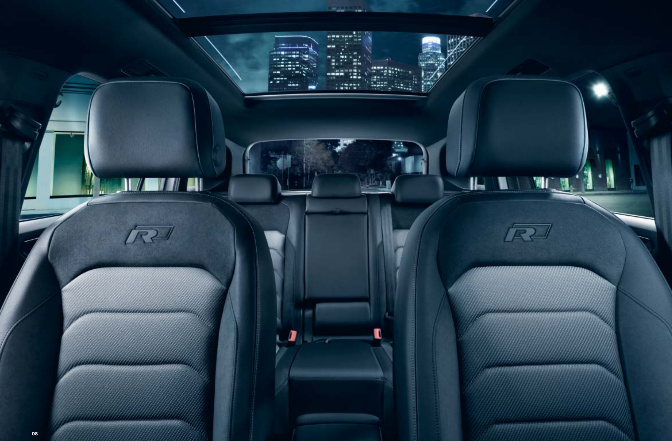
08 Confident style and assured curves: the front R-Line top-quality de luxe front seats provide the ideal seating position, at the same time as exuding perfect sporting elegance. They feature "Race" fabric upholstery in Magnetite Grey and an R-Line logo on the backrest. The backrest side bolsters in "San Remo" Anthracite microfibre create an effective statement with Crystal Grey stitching. The moulded headliner in black sets everything off perfectly. The head restraints, outer seat bolsters and the middle seat come in a leather-look design, along with the centre armrest and door inserts. SO