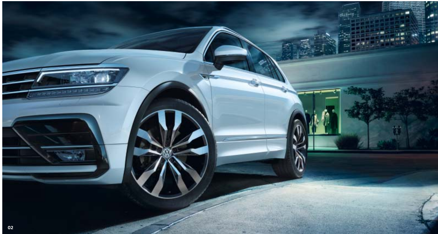
02 Automotive sporting prowess starts on the road. The 20-inch “Suzuka” alloy wheels in Dark Graphite with a burnished finish exude their unadulterated superiority. 50