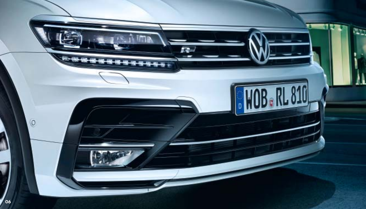
06 Tiguan with an exclamation mark: the R-Line logo on the radiator grille shows off the car's athleticism for all to see. Just like the bold C-signature design of the bumper. SO