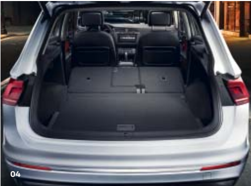
02 – 04 Always precisely the amount of space you need: the rear seat bench and backrests with a load-through hatch can be folded asymmetrically and moved. As a result, you can expand the luggage compartment volume to 1,655 litres in just a few steps. C H SO