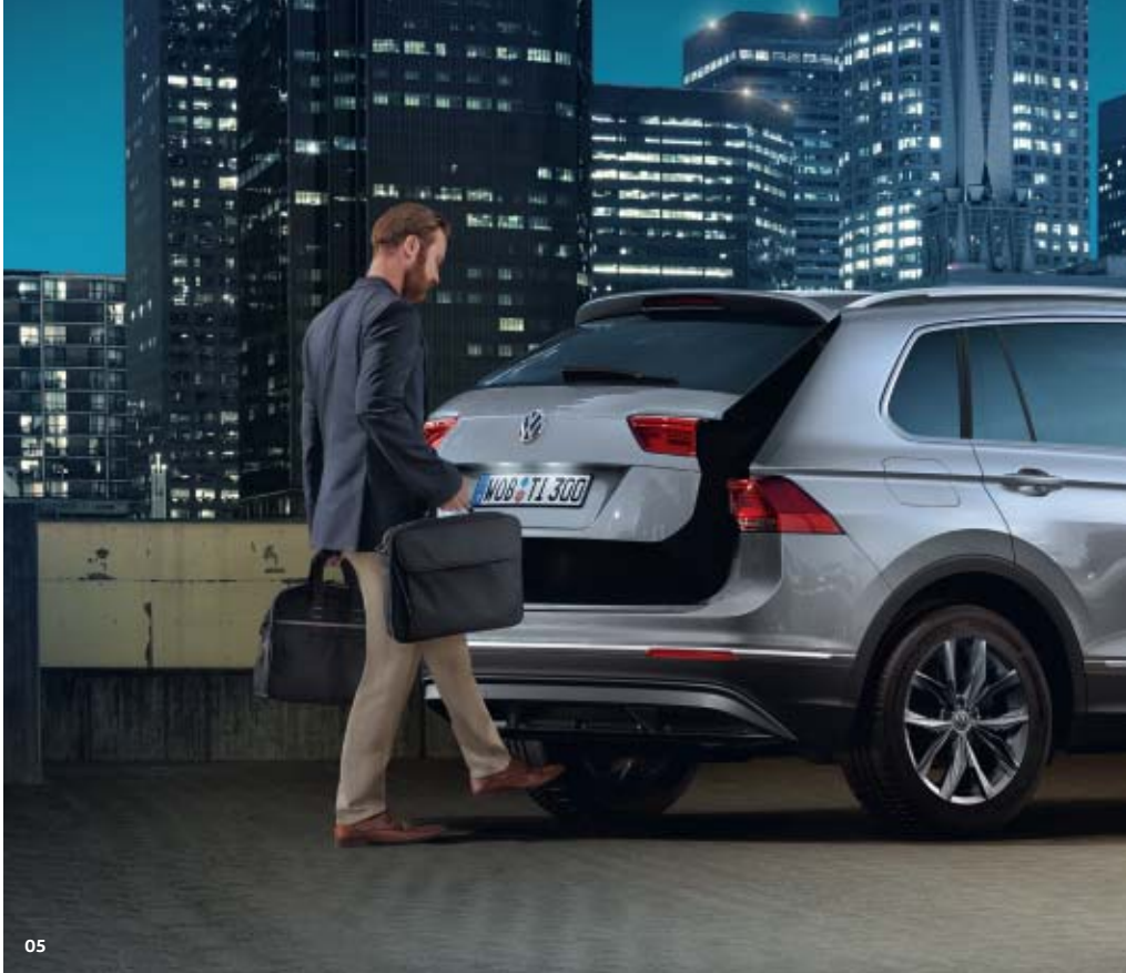
05 With “Easy Open” , you can guarantee a relaxing journey, even before you’ve actually set off. For instance, when loading heavy suitcases into the luggage compartment, you no longer need to set them down while you fumble for your keys – a brief movement of your foot beneath the vehicle rear is all that’s needed to open the electric tailgate automatically. And with electric closing function, it shuts at the press of a button as you move away from the vehicle. SO