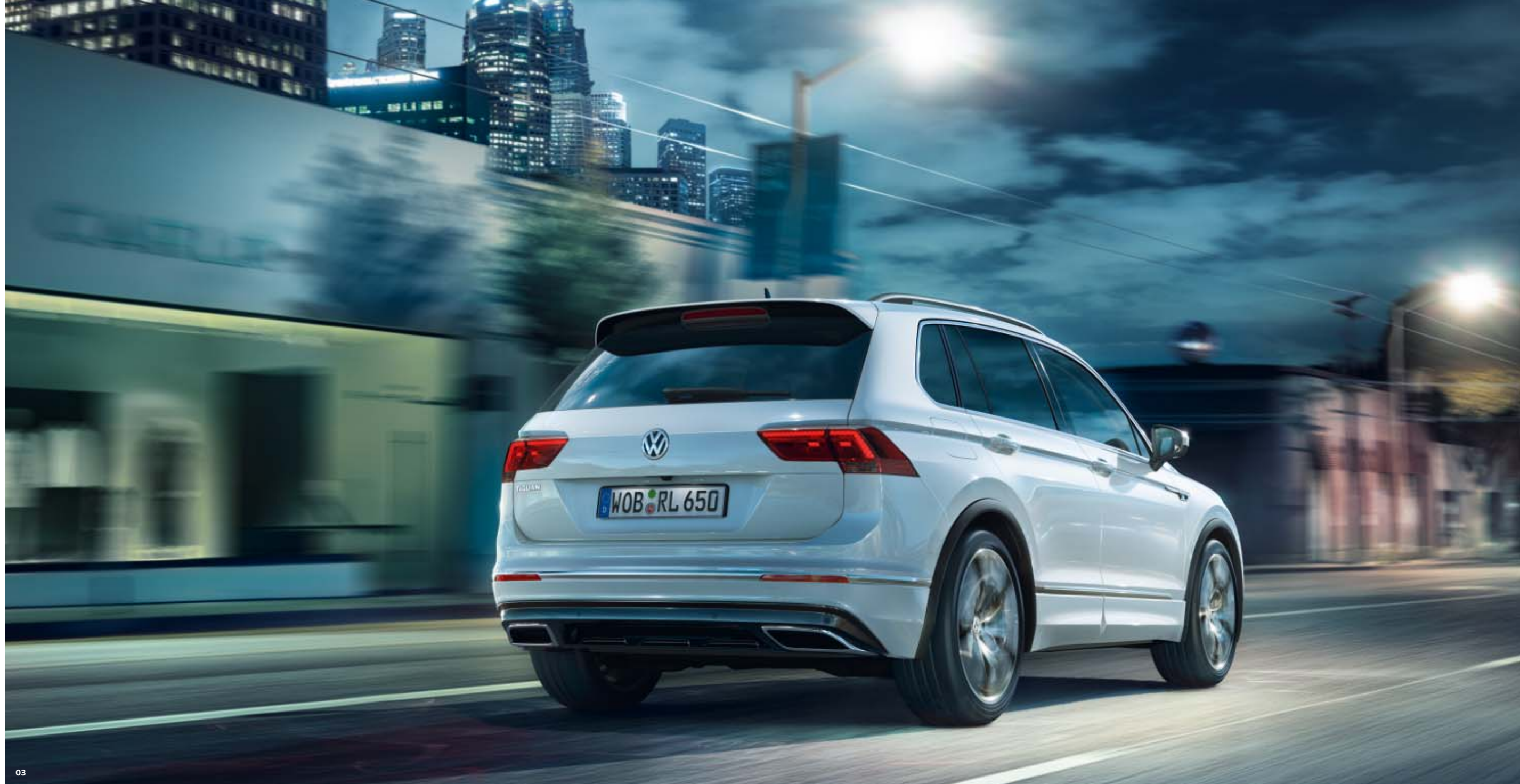
03 Final score: performance sport. The R-Line bumpers at the front and rear, the black gloss diffuser , and the rear spoiler give the Tiguan’s appearance a truly dynamic makeover. The black wheel sill extensions , the colour-keyed door trim elements and the design strips with the R-Line logo on the side panels and doors make it looks great from the side, too. 50

Standard equipment 55 Comfortline 60 Highline 70 Optional extra 50 Illustration shows 162 kW (220 bhp) TSI: fuel consumption in l/100 km: 9.7 (urban)/6.7 (extra-urban)/7.8 (combined), CO 2 emissions in g/km: 180 (combined), efficiency class: D.